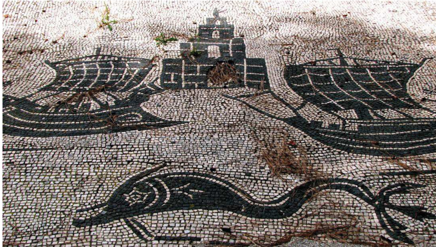
Fig. 1: Mosaic from the Square of the Guilds. Sea motifs.