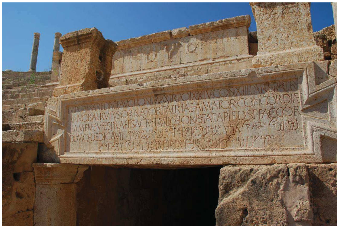
Fig. 3: Bilingual Inscription from Leptis Magna.