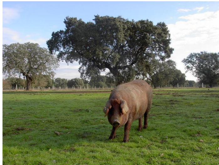
Iberian pig in free-range.

It is an easy, fast and feasible method that it is available for the Iberian pig producers as predictor of the economic value to obtain for their pigs, for the meat industry as a measurement of quality control, for dealers control, etc.