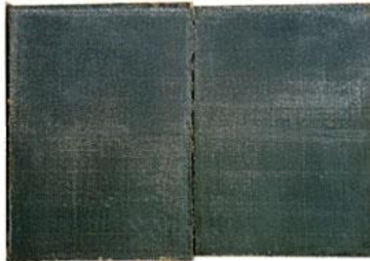
Sample of the new pictorial supporter

The present invention relates to a new supporter for transfer applications in restoration of mural painting that need flexibility and for the accomplishment of pictorial and sculptural works, based on a simple sheet of advanced composite materials.