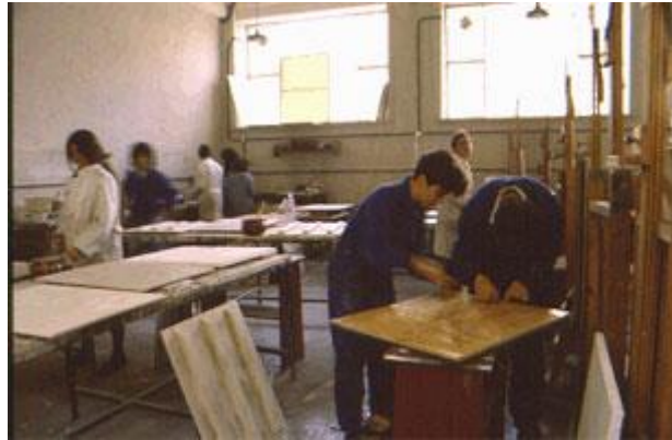
Restoration in the Faculty of Fine Arts.

This new support structure presents a great ease for its manipulation, being very convenient for the manufacture of pieces, as much flat as three-dimensional, in which a high quality rigidity is not required.