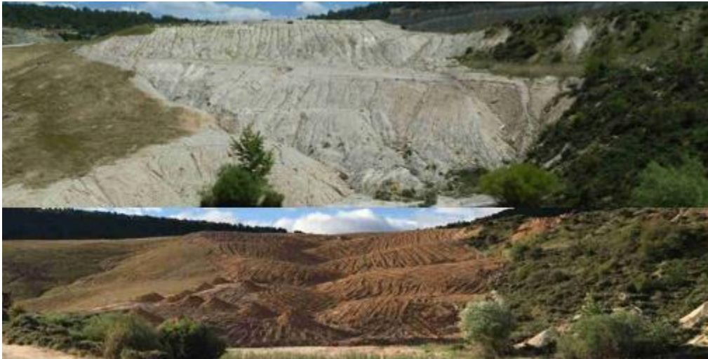
Restoration at the Nuria Mine, 2017.

Over the last decades, hydrologists have observed and measured stable natural streams and determined mathematical relationships that describe these stable stream types. Essential among these determinations is that channel morphology is directly related to bankfull and flood prone discharges. The natural channel is shaped to keep its sediment load and stream flow in balance during both low-flow and extreme events. The GeoFluv fluvial geomorphic approach to land reclamation relates the upland landforms to the stream channel form. Both can be formed similarly by flowing water. Previous application of alternative land-shaping practices may have been limited for several reasons, including the narrow extent of training in fluvial geomorphic principles and the complexity of the calculations to create an integrated landform, Natural Regrade addresses all these potential limitations. GeoFluv makes a draft landform based on empirically determined fluvial geomorphic mathematical relationships. The final design can be output as a 3D surface file for input to GPS-machine guidance equipment to aid construction.