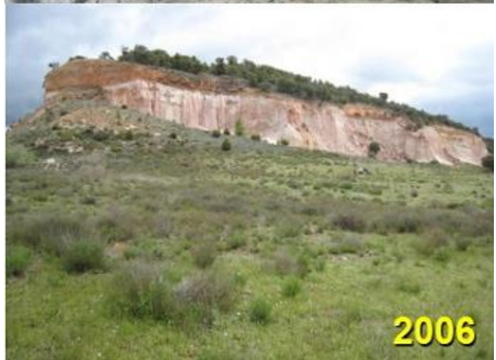
Ecological restoration based on geomorphic restoration at La Revilla (Segovia). 1995-2006.