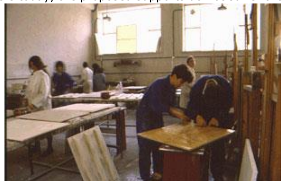
Restoration in the Faculty of Fine Arts.

Faced with the negative behavior of the media that the market offers today, the proposed supports do not suffer the damages mentioned above and are configured in such a way that the movements are virtually minimized or are synchronous to those of the pictorial layer, therefore, the durability of the work is augmented.