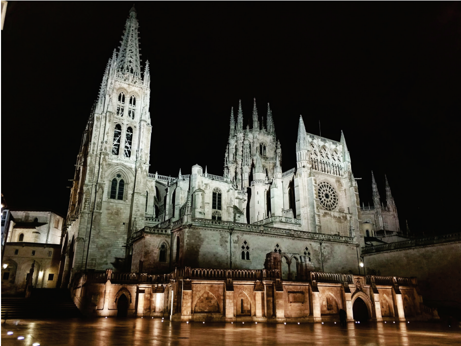
Figure 1.1. Burgos Cathedral, Spain. Night-time illumination, stained-glass windows.

greater luminosity and improve the appearance of large buildings through the construction of large windows. In the nineteenth century the popularity of stoves as a heat source was so widespread that the correct orientation of the façades of buildings was neglected, eroding concerns about solar effects.