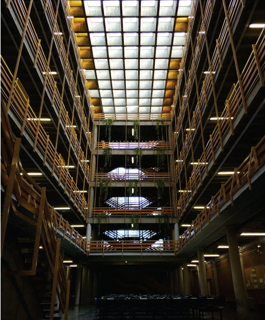
Figure 1.2. Faculty of Optics and Optometry, University Complutense of Madrid, Spain. Natural-lighting design in architecture.

We can divide the strategies of natural lighting design development into two large groups [20, 21, 22]. The first includes lateral lighting systems, in which the light is captured from the side of the building towards the interior. Currently, there is a great variety of developments that direct and distribute light although the examples more widely used are windows. The second group in-