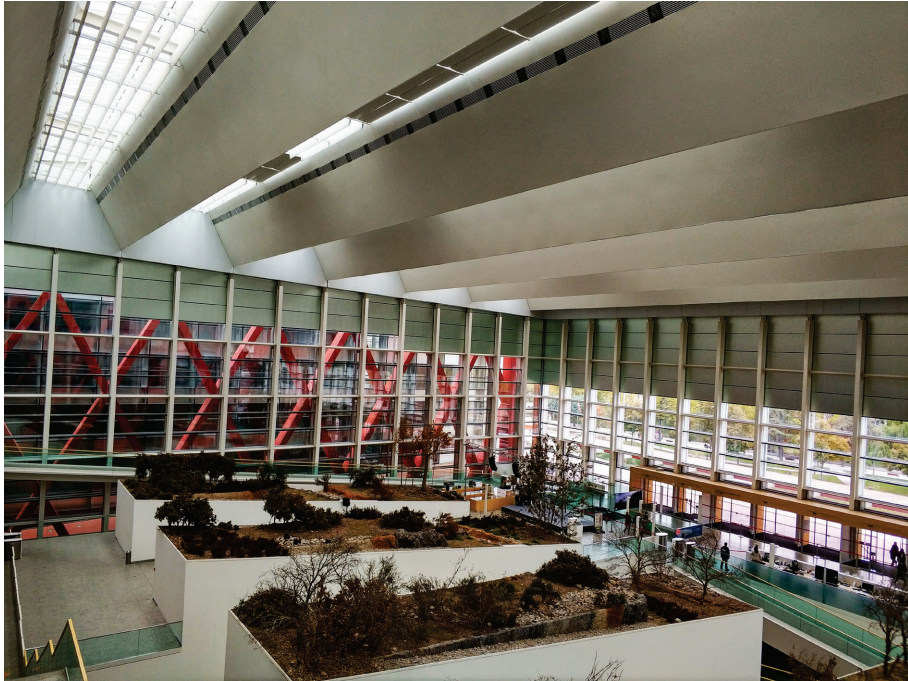
Figure 1.3. Interior view of Museum of Human Evolution, Burgos, Spain. Natural-lighting design in architecture.

cludes roof lighting systems (ceiling) whereby light is captured from the top of the building and distributed inside. An example of this are skylights, which can be defined as open windows in the ceiling or in the higher segments the walls where light enters. Changing the orientation of these systems, as well as their size and location, has been able to increase their effectiveness.