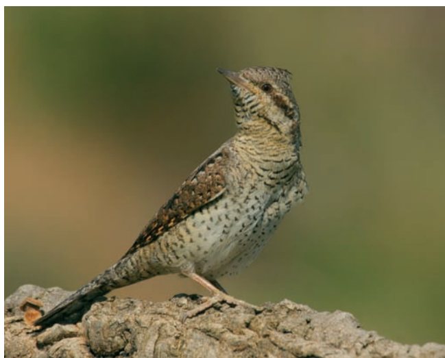
Eurasian Wryneck. Central Spain; May 2005.

To the American birder visiting Europe for the first time, the first Spanish birds may seem familiar. The center of town, for example, is hopping with House Sparrows and Rock Pigeons, along with the very similar but more arboreal Stock Dove ( Columba oenas ), which nests in sycamores lining such main streets as the north-south Paseo de la Castellana. Most Madrid starlings sport only tiny spots from late summer to late winter; from March into summer they have none. That's because they are not European Starlings but a separate species, the Spotless Starling ( Sturnus unicolor ). (In winter, migrating European Starlings appear, but Spotless Starlings are always common.) In the heart of town, the only corvid normally encountered is the Eurasian Magpie ( Pica pica ), now split from North America's Black-billed Magpie but very similar in appearance. Eurasian Blackbirds, Great ( Parus major ) and Blue ( P. caeruleus ) Tits, and Eurasian Goldfinches will remind American birders of American Robins, chickadees, and goldfinches back home. In addition, chunky Woodpigeons ( Columba palumbus ) clamber over thin branches in street-