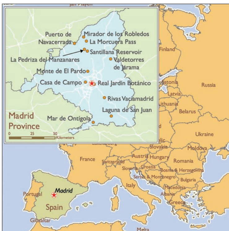
Map by © Kei Sochi.

side trees, flashing white wing crescents, while from April to September, Common Swifts dominate the skies, screaming by in squadrons and nesting in cracks in buildings.