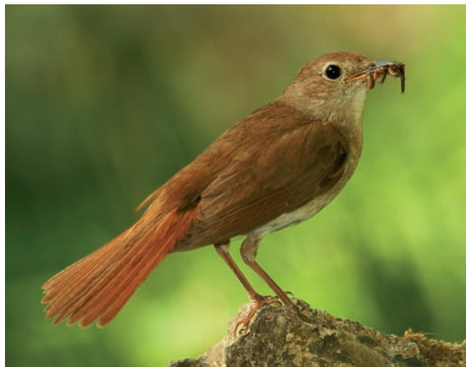
Common Nightingale ( Luscinia megarhynchos ). Central Spain; May 2005.

The laguna sits about 3.7 miles (5.9 kilometers) west of the charming little hilltop town of Chinchón, with its crumbling castle, parador, church, and restaurants ringing a plaza