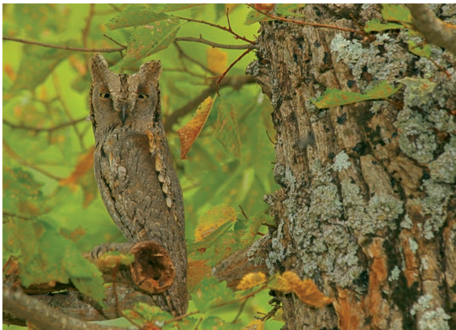
Eurasian Scops-Owl ( Otus scops ). Central Spain; June 2005.

In places, paths run along the public boundary, providing sweeping views, through a chain-link fence, of the expansive oak-studded pasture or dehesa beyond. From March or April into summer, such viewpoints—particularly early or late in the day—can be productive for Great Spotted Cuckoo, Azure-winged Magpie, calling Red-necked Nightjar ( Caprimulgus ruficollis ), and Eurasian Scops-Owl ( Otus