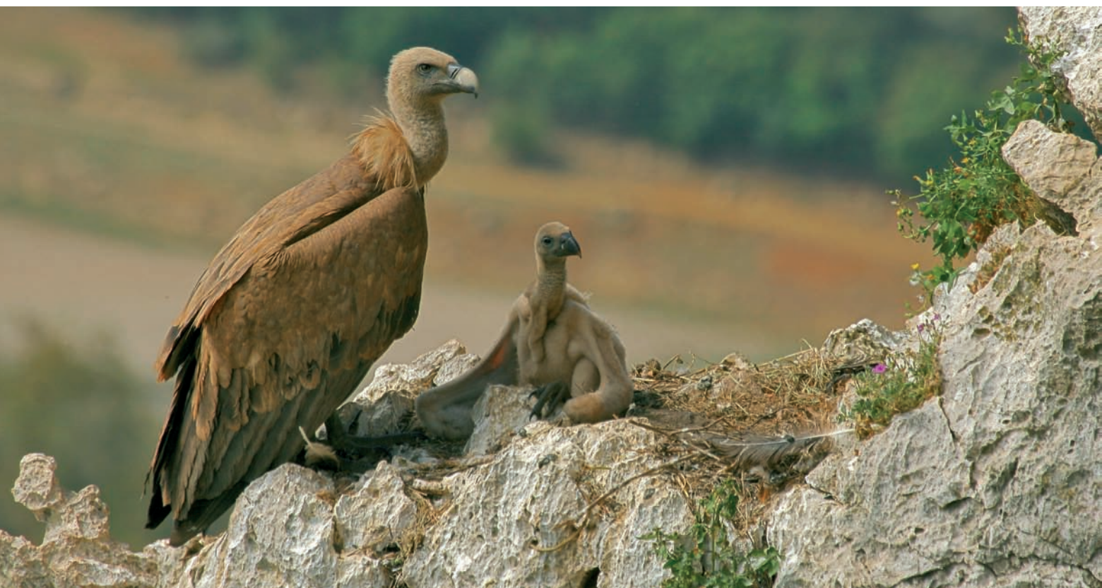
Eurasian Griffon Vulture ( Gyps fulvus ). Central Spain; May 2005.

nest, while down below a stream trickles by. In April and May, Woodchat Shrikes, migrating Whinchats ( Saxicola rubetra ), Northern Wheatears, Common Skylarks ( Alauda arvensis ), and Woodlarks are easy to see, and nine or more warbler species may pop up along the trail. Warblers that nest here include Orphean ( Sylvia hortensis ) with its somewhat mockingbird-like song, Subalpine ( S. cantillans ), Sardinian ( S. melanocephala ), Dartford ( S. undata ), Melodious, and Cetti's. Eurasian Jays ( Garrulus glandarius ) and Azure-winged Magpies may be seen flapping overhead or working the copes of trees.