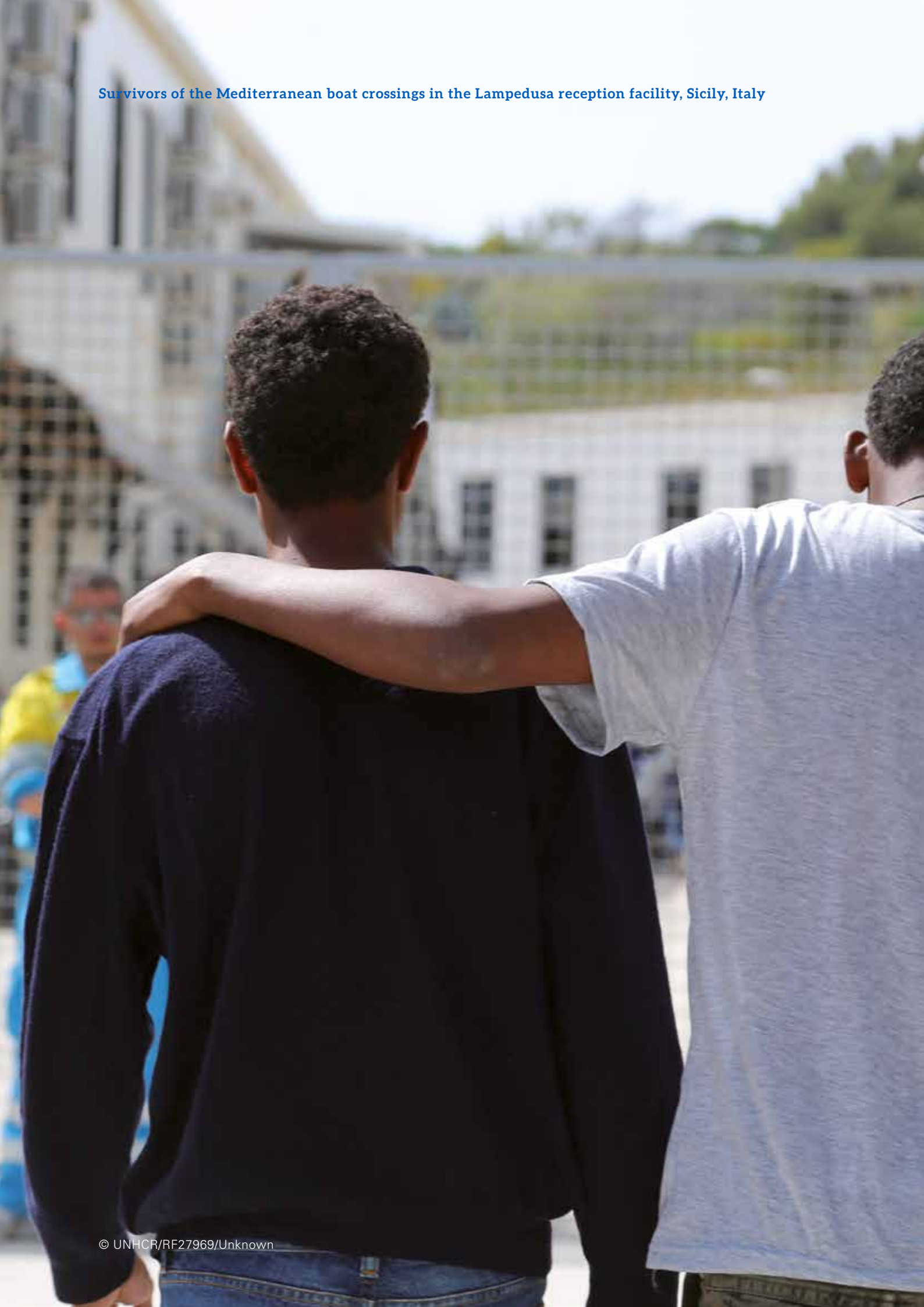
Survivors of the Mediterranean boat crossings in the Lampedusa reception facility, Sicily, Italy