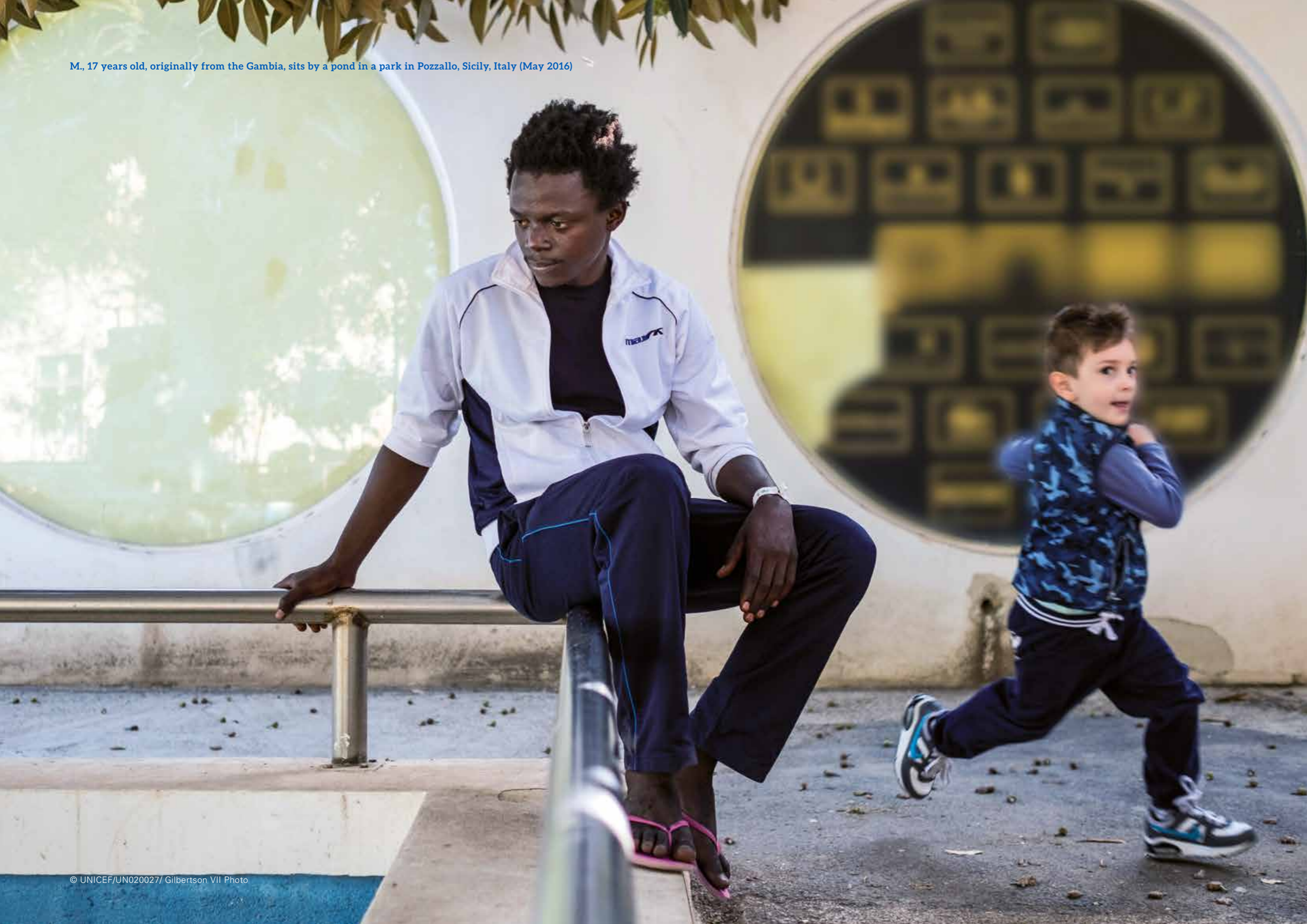
M., 17 years old, originally from the Gambia, sits by a pond in a park in Pozzallo, Sicily, Italy (May 2016)