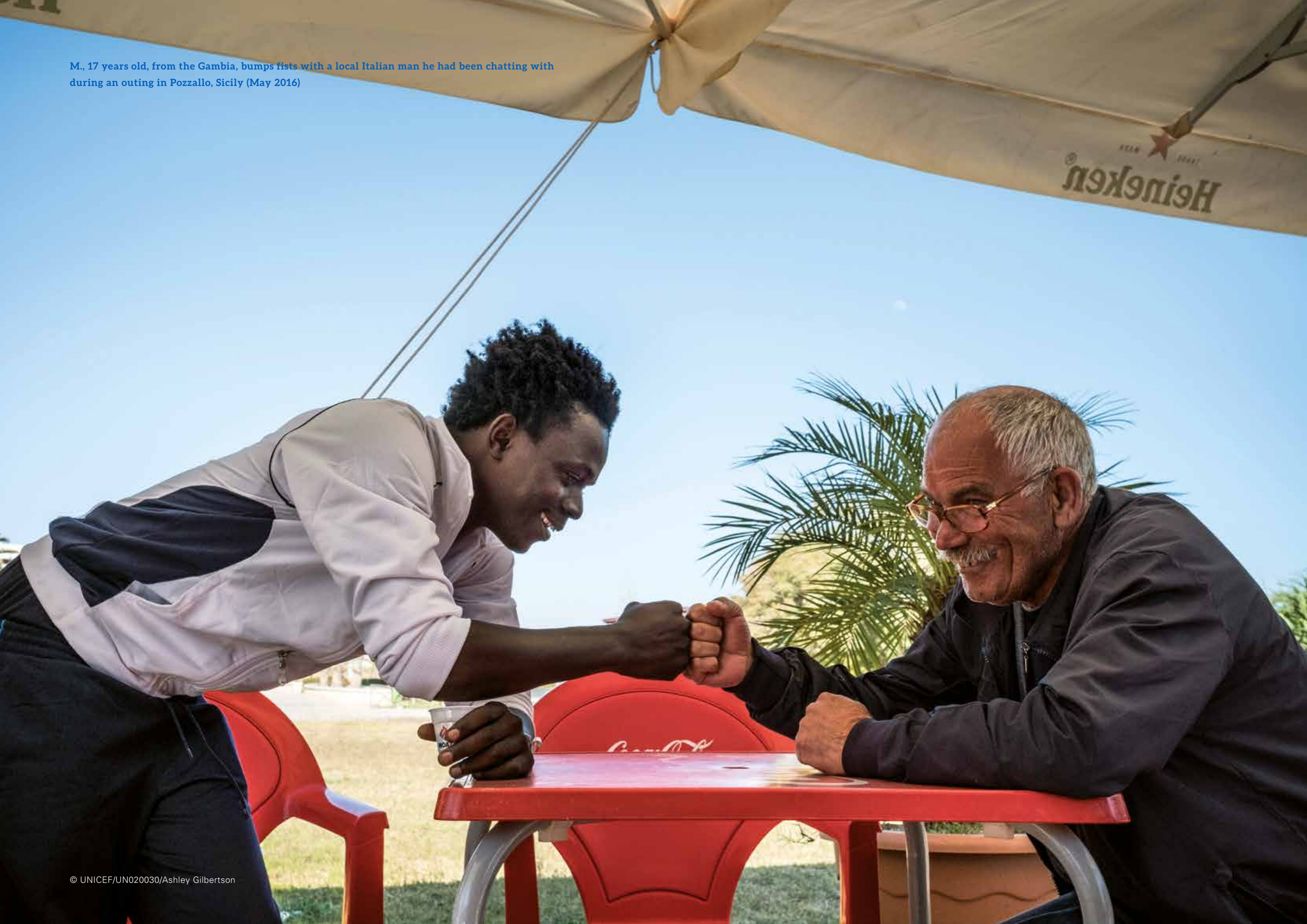
M., 17 years old, from the Gambia, bumps fists with a local Italian man he had been chatting with during an outing in Pozzallo, Sicily (May 2016)