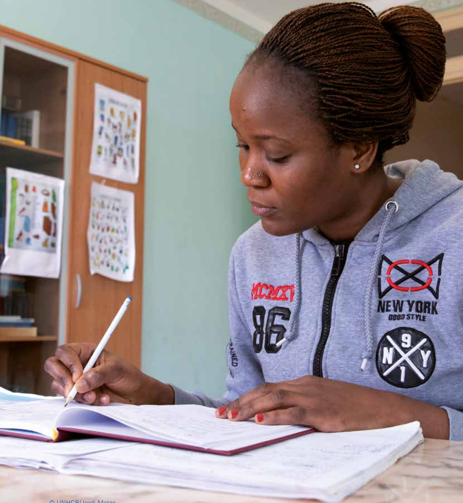
S., from Nigeria, studying Italian at Figlie del Divino Zelo Giardini Naxos (The Daughters of Divine Zeal) in Messina, Sicily, Italy, April 2018.