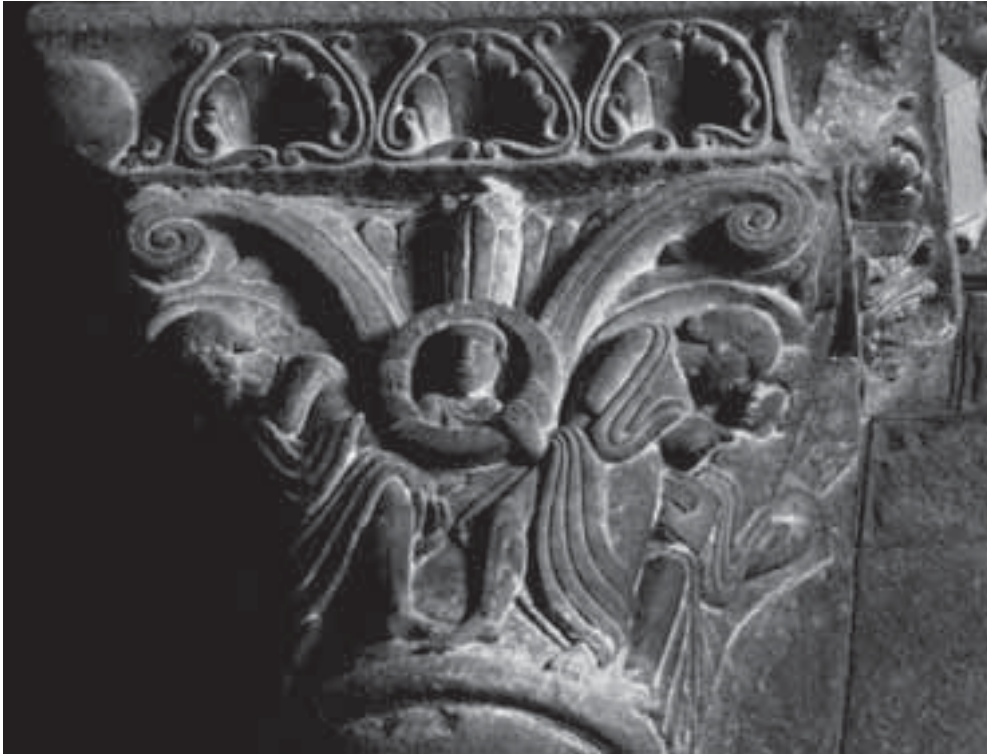
Fig. 13. Capital, interior, Jaca cathedral.

example of an early work, we can compare the motif of the imago clipeata on an interior capital of the cathedral (fig. 13), on the east side of the northwest crossing pier, with representations of the same subject on many Roman and Early Christian sarcophagi, such as the one found today in San Pedro el Viejo in Huesca (fig. 14), reemployed to house the body of King Ramiro II, el monje , son of Sancho Ramírez, who died in 1157, 39 or on a sarcophagus of about 230 A.D. in the Dumbarton Oaks Collection, perhaps a closer example, since the figures supporting the clipeata are erect, as they are on the Jaca capital. 40 Neither example is meant to propose an actual source of the Jaca formula, but to suggest that the motif was a common one in the art of antiquity. Another example, worth citing because it demonstrates that the reliance on the Roman past also can be seen in the later works of the cathedral, is the faun on a capital currently used as a support for the altar of the south apse but