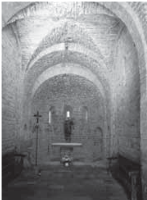
Fig. 6. Interior, San Caprasio, Santa Cruz de la Serós.