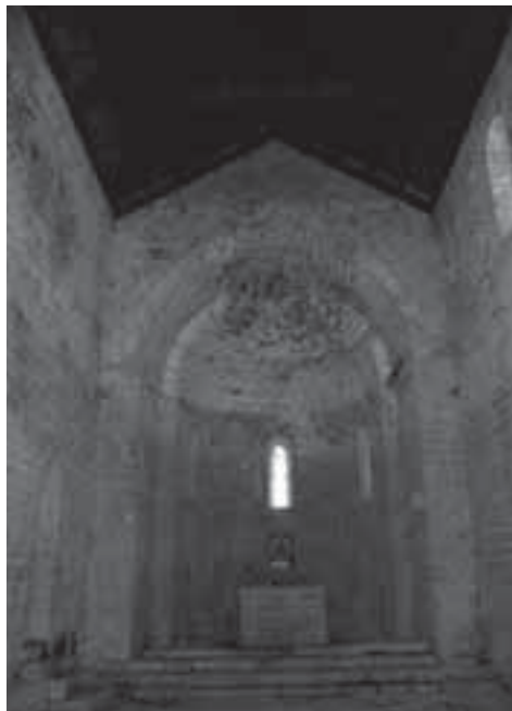
Fig. 8. Interior, San Adrián de Sasabe.