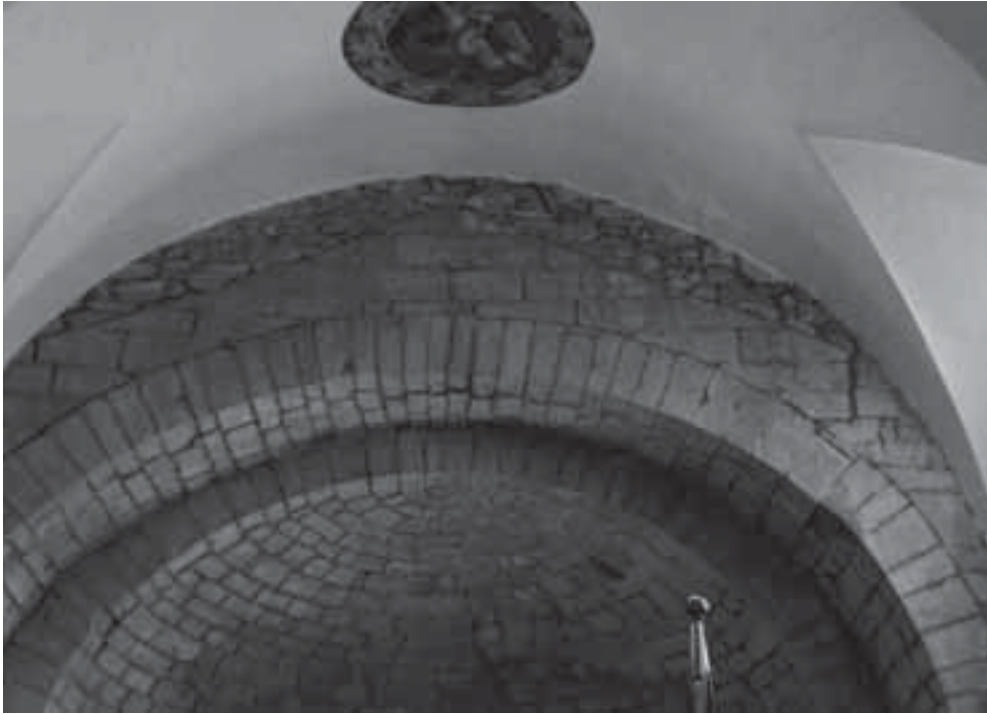
Fig. 10. Interior, detail, San Salvador, Javierrelatre.