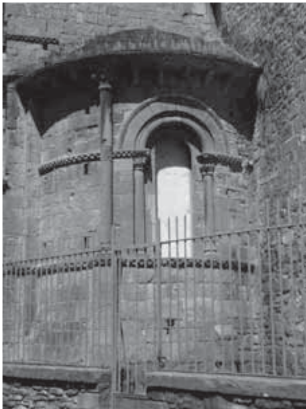
Fig. 1. South apse, Jaca cathedral.

Thus, the cathedral of Jaca is probably the product of a much slower development than it would at first appear, since its most prominent constructive features are those that reject the traditional manner of building in Altoaragón, that is precisely those features that must have characterized the cathedral’s original building program, which Esteban describes. The point can best be illustrated by comparing Jaca cathedral (fig. 1) with the Torre de la Reina within the castle confines of Loarre (fig. 2), of about 1020 or 1030, or with the church of San Caprasio in Santa Cruz de la Serós (fig. 3), of about the same date, 19 buildings in the so-called First Romanesque or Lombard style. Evident is the change from the irregular masonry ( sillarejo ) of the early buildings to the evenly cut and finely laid ashlar masonry ( sillería ) of the cathedral. Apparent as well at Jaca and absent in the early works of the region are decorative features such as billet moldings, which articulate and separate