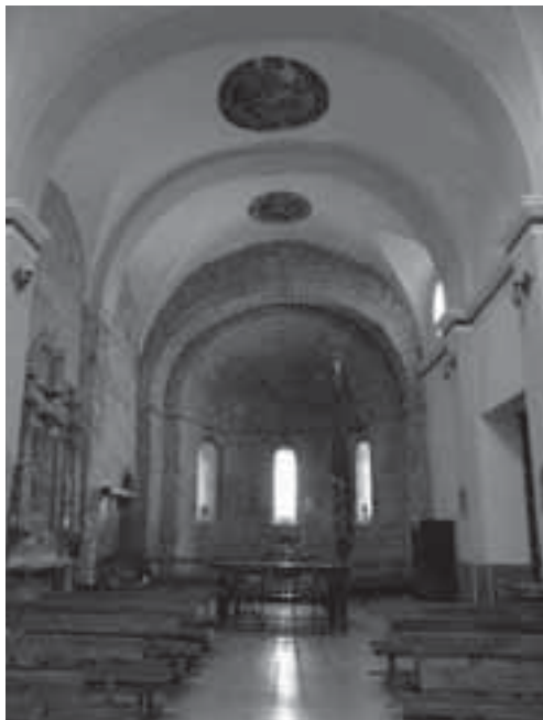
Fig. 9. Interior, San Salvador, Javierrelatre.

Iguacel, was patronized by members of the royal circle, who were also patrons of the cathedral of Jaca.