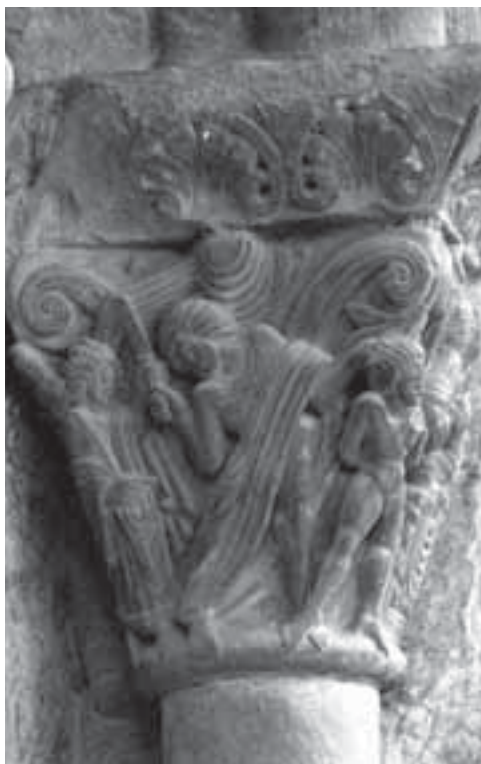
Fig. 12. Capital, south portal, Jaca cathedral.

The reliance on the antique past is indeed profound at Jaca, sufficiently so for Marcel Durliat to describe the sculptor of a south portal capital depicting the Sacrifice of Isaac (fig. 12) as que on peut qualifier d'exceptionnel. Il se distingue de ses contemporains des environs de 1100 par l'attention qu'il porte à l'enseignement de l'antiquité classique. En partant d'analyses aiguës de sarcophages romains, il introduisit le 'nu héroïque' dans l'art chrétien et il fit accomplir des progrès marqués à la composition roman. Durliat allows for the possibility that this sculptor's work might be considered one of the sources of the Renaissance of the twelfth century, a remarkable claim indeed. 37