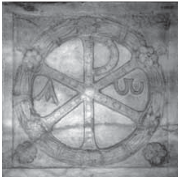
Fig. 18. Sarcophagus, Museo Pio Cristiano, Vatican.

The complex inscriptions that decorate the Jaca tympanum have been well studied. Those behind the lions and on the lintel concern penance, promising rewards for those who practice the penitential rites and punishment for those who ignore them. Although the inscription surrounding the chrismon has stirred intense scholarly debate, there is general agreement on its fundamental nature. This inscription interprets the chrismon as a sign of the Trinity: + HAC IN SCVLPTVRA LECTOR SIC NOSCERE CVRA, P PATER. A GENITVS. DVPLEX EST SPIRITVS ALMVS, HII TRES IVRE QVIDEM DOMINVS