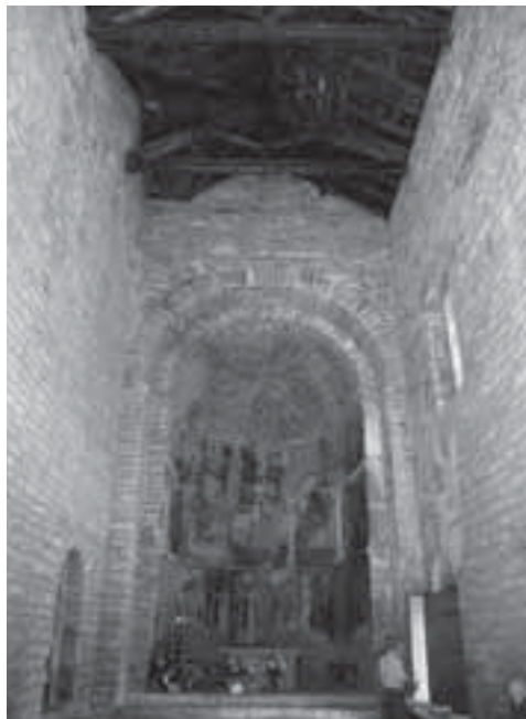
Fig. 7. Interior, Santa María de Iguacel.

their patrons members of the royal circle, who were also patrons of the cathedral. The inscription over the west door of Santa María de Iguacel relates that it was the ayo or eitán , that is, the tutor, of King Sancho Ramírez, Count Sancho Galíndez and his wife Urraca who were responsible for the construction of the building. 32 And the most likely candidate to have been patron of the church of San Salvador de Javierrelatre was the lord of the village, Count Sancho Ramírez, illegitimate son of Ramiro I and half-brother of King Sancho Ramírez. 33 It was the same Count Sancho who in 1105 financed the construction of a chapel in the precincts of Jaca cathedral, where he was to be buried. 34 Thus, Javierrelatre, like