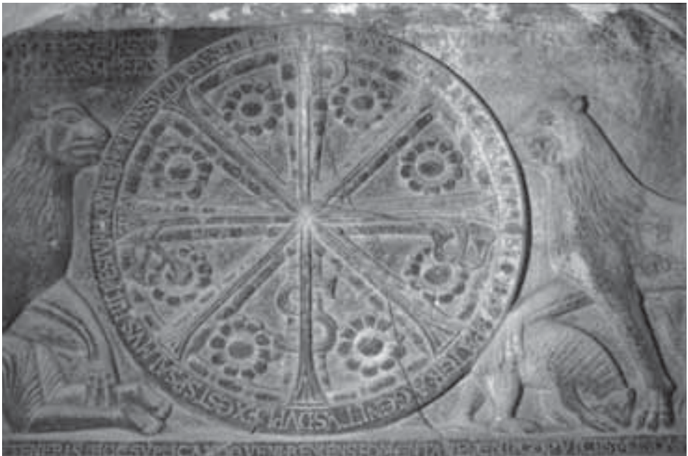
Fig. 17. Tympanum, west portal, detail of chrismon, Jaca cathedral.