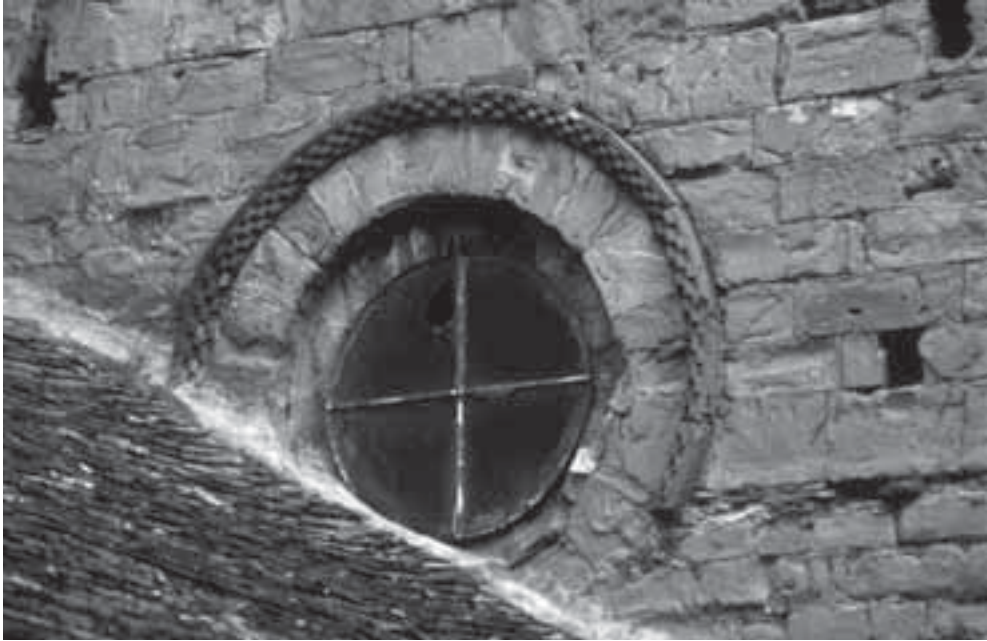
Fig. 19. Jaca cathedral, bull-eye window.

It is, in truth, hard to imagine what contemporary viewers might have thought of the large and noble stone building covered with a timber roof. But, then again, this architectural form was not the only unusual feature of the cathedral. The tympanum, so beautifully composed and elegantly placed, was, as I have mentioned, certainly among the first tympana in Europe. And, the meaning and placement of the Jaca tympanum, as I and others have tried to demonstrate, seem certainly to have been tied to the identity (or self-identity) of the newly established Aragonese king and kingdom, bishop and bishopric. Thus, it would not be surprising to find that similar concerns to those expressed on the tympanum might well have affected the choice of the architectural forms employed for the design of the building, including its wooden roof.