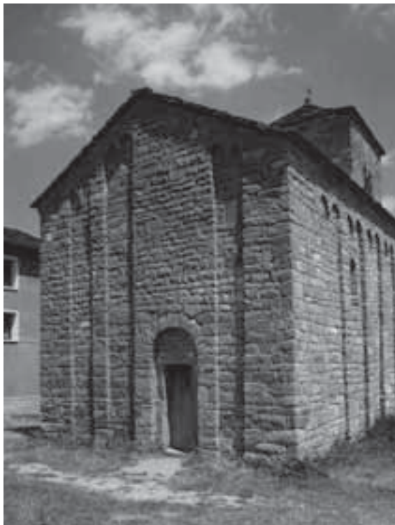
Fig. 3. San Caprasio, Santa Cruz de la Serós.

The Jaca cathedral that we see today (fig. 4) has suffered various renovations, transformations, and restorations to the Romanesque building that include the introduction of side chapels in the sixteenth century; 24 the rebuilding of the cloister, between 1615 and 1620, a project that lasted until 1693; 25 the destruction, reconstruction, and elongation of the main apse between 1790 and 1792; 26 and the addition of Renaissance vaulting to the nave