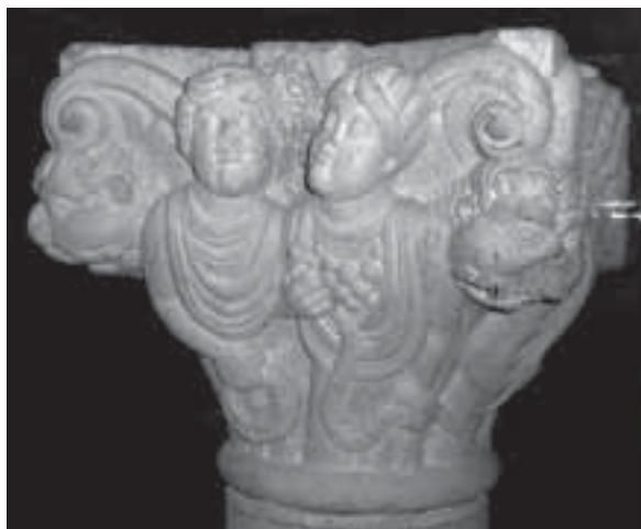
Fig. 15. Capital, Church of Santiago, Jaca.

tympanum is decorated with a central motif, the chrismon (fig. 17), comprised of a chi and a rho , the first two letters of Christ's name in Greek. The Jaca chrismon is undoubtedly derived, once again, from a device commonly depicted on Early Christian sarcophagi, 44 for example, on one represented in the collection of the Museo Pio Cristiano in the Vatican (fig. 18). Both chrismons are of the type that includes an alpha and an omega , the first letters of Christ's name in Greek, in reference to Christ's characteriza-