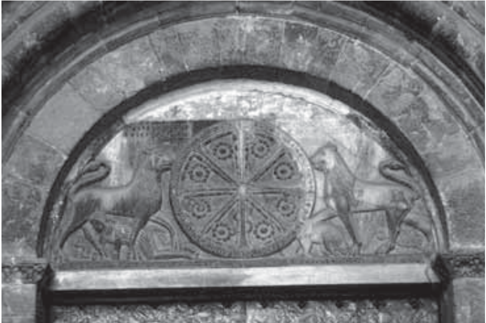
Fig. 16. Tympanum, west portal, Jaca cathedral.