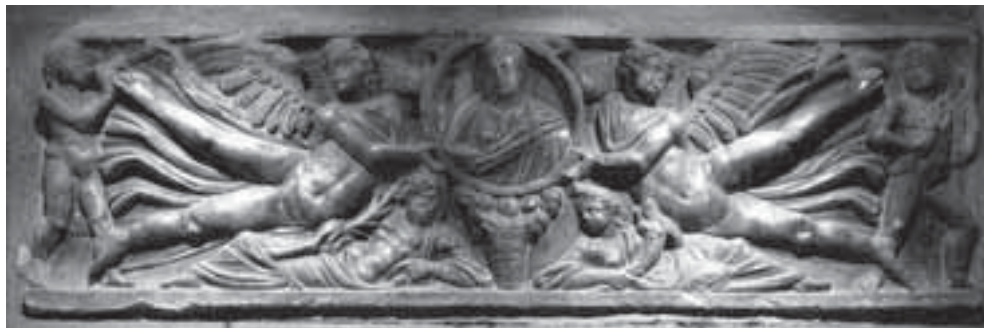
Fig. 14. Sarcophagus of Ramiro II, San Pedro el Viejo, Huesca.

probably originally part of the now-dismantled cloister, which relies on another Roman sarcophagus motif, where the erotic, or at least suggestive, gesture of the hand on the faun's buttocks is reminiscent of that of the representation on the capital. 41