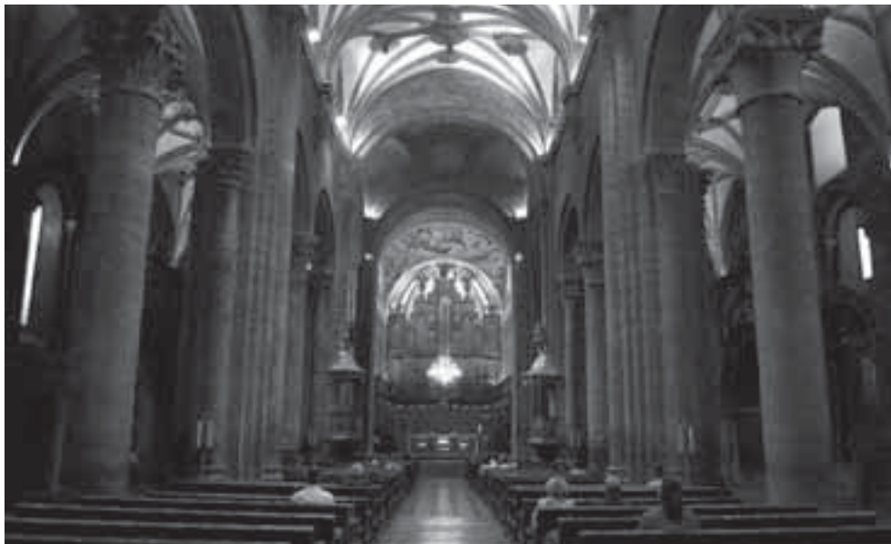
Fig. 4. Interior, Jaca cathedral.

and side aisles of the cathedral, which was undertaken throughout the sixteenth century, the side aisle vaults dating to 1520 and the central nave vault dating to between 1598 and 1601. 27