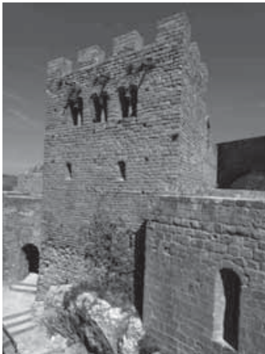
Fig. 2. Torre de la Reina, Loarre.

the various architectonic elements of the building. Moreover, the proliferation of sculpture, including carved tympana, capitals, abaci, corbels, and metopes, distinguishes Jaca from the earlier examples, where these features are lacking.