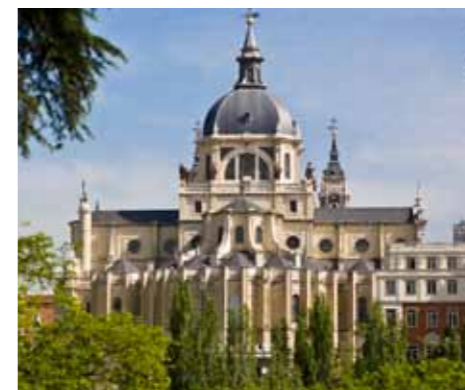
Catedral de la Almudena