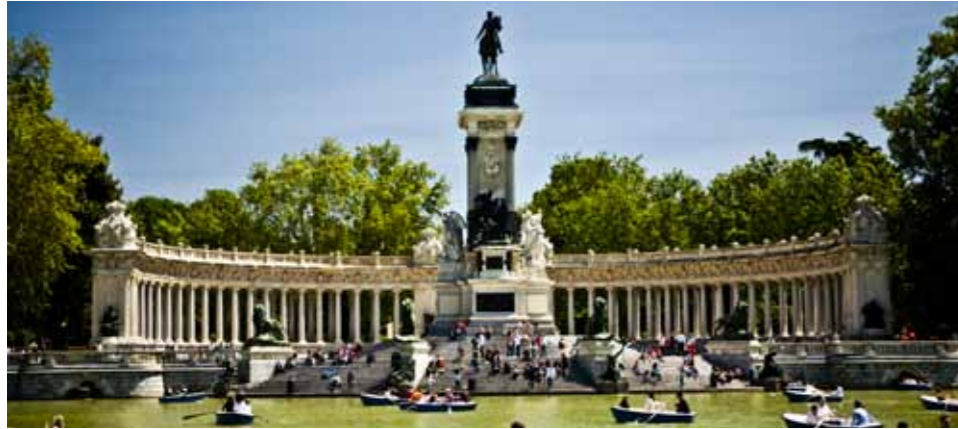
The Retiro Park