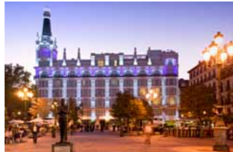
Barrio de las Letras