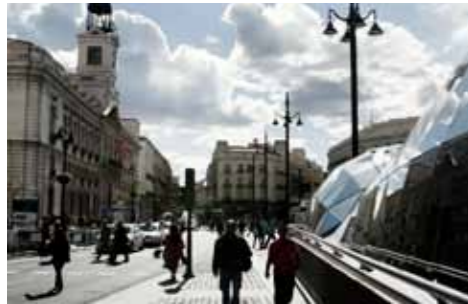
Puerta del Sol