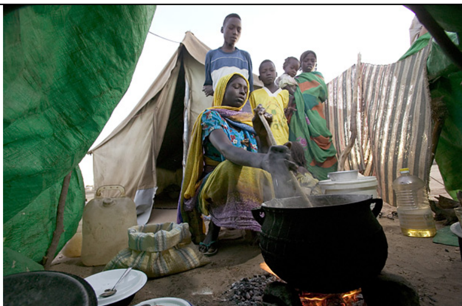
BREIDJING REFUGEE CAMP, CHAD: STIRRING THE POT

A refugee woman sifts through sand in order to pluck out any bits of grain which might have dropped to the ground during the previous day's ration disbursement.