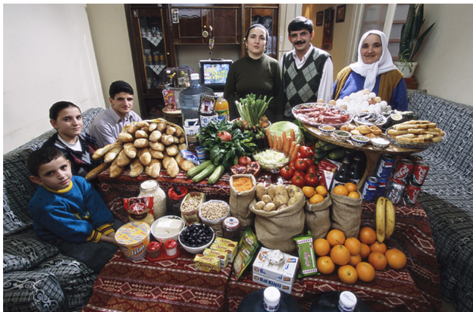
TURKEY: The Celiks of Istanbul FOOD EXPENDITURE FOR ONE WEEK: 198.48 New Turkish liras or $145.88 FAVORITE FOODS: Melahat's Puffed Pastries

A. Carbajal. Dpto Nutrición. F. Farmacia. UCM