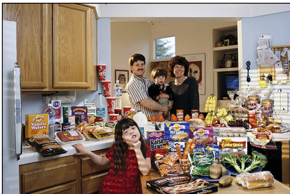
UNITED STATES: The Caven family of California FOOD EXPENDITURE FOR ONE WEEK: $159.18 FAVORITE FOODS: beef stew, berry yogurt sundae, clam chowder, ice cream

A. Carbajal. Dpto Nutrición. F. Farmacia. UCM