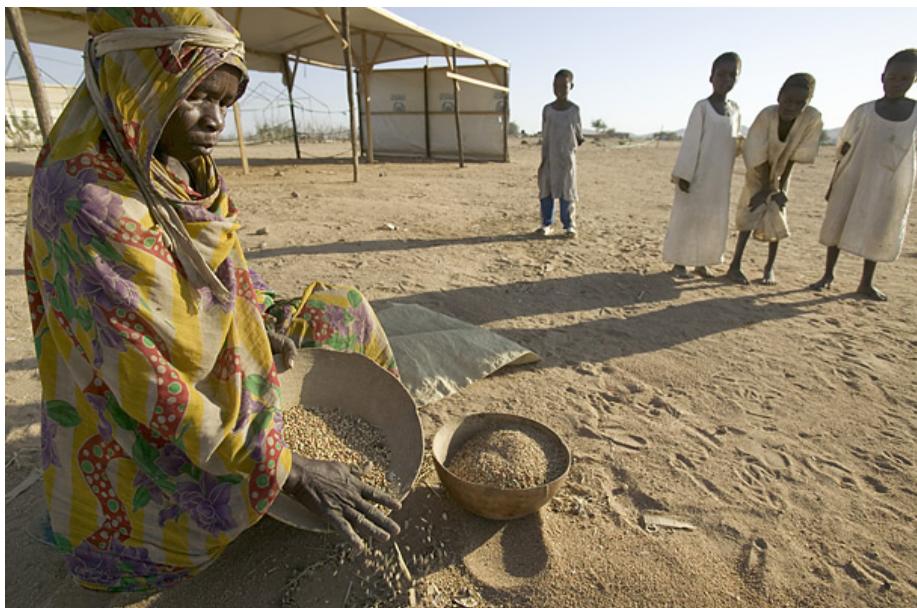
BREIDJING REFUGEE CAMP, CHAD: UNITED NATIONS FOOD DISTRIBUTION CENTER

A refugee woman sifts through sand in order to pluck out any bits of grain which might have dropped to the ground during the previous day's ration disbursement.