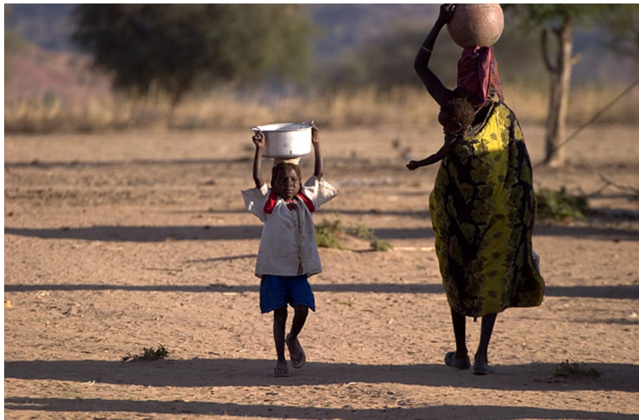
BREIDJING REFUGEE CAMP, CHAD: WATER BEARERS A woman and child carry drinking and cooking water from a distribution point back to their tent