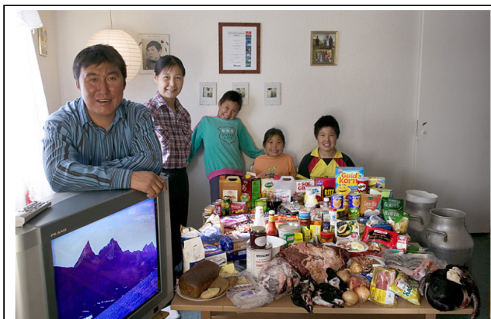
GREENLAND: The Madsens of Cap Hope FOOD EXPENDITURE FOR ONE WEEK: 1,928.80 Danish krone or $277.12 FAVORITE FOODS: polar bear, narwhal skin, seal stew

A. Carbajal. Dpto Nutrición. F. Farmacia. UCM