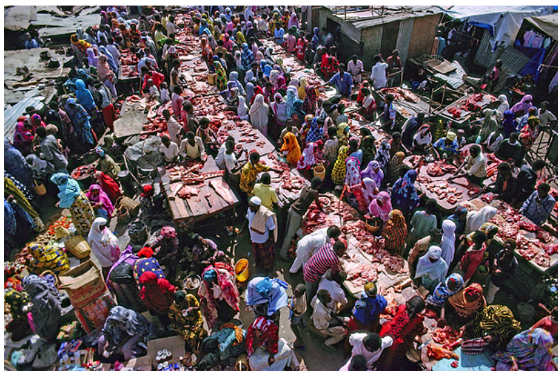
HARGESIA, SOMALIA: BUTCHERS' MARKET Residents shop for beef, mutton and camel meat.