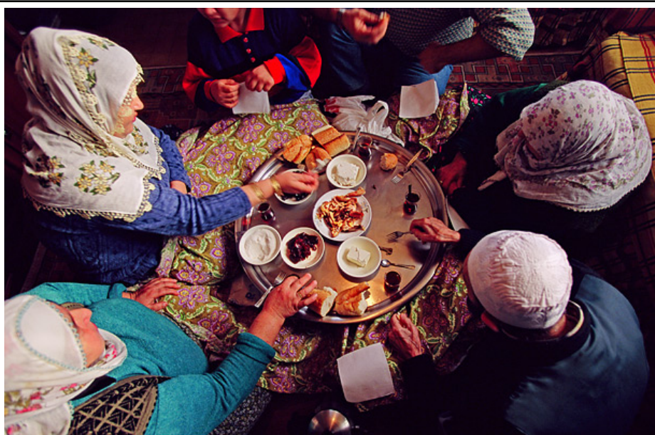
ISTANBUL, TURKEY: DINNER TIME The Cinar family gathers on the floor of their living room to share the morning meal: feta cheese, olives, leftover chicken, bread, rose jam and sweet, strong tea.

A. Carbajal. Dpto Nutrición. F. Farmacia. UCM