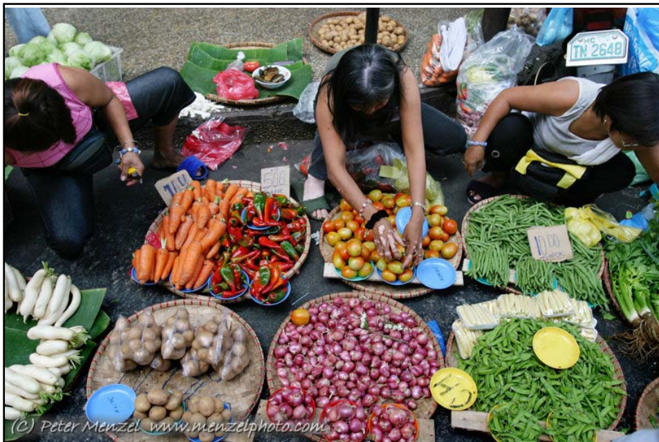
Vendors selling a variety of vegetables at the Divisoria market, Manila, Philippines