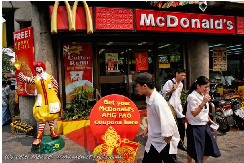
McDonald's fast food chain in Manila, Philippines