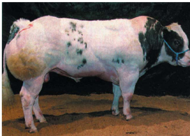
Fig. 1 Double-muscled Belgian Blue animal homozygous for the nt821del(11) deletion in the myostatin gene.

To refine the correspondence between the HSA2q31–33 and BTA2q12–22 maps, we developed comparative anchored tagged sequences (CATS)—primer pairs that would amplify an STS from the orthologous gene in different species 9 —for a series of genes flanking Col3A1 on the human map and for which sequence information was available in more than one mammal. In addition to Col3A1 , CATS were obtained for Col5A2 , INPP1 , TFPI , TTN , CHN , GAD1 , CTLA4 and CD28 . We used these CATS, as well as all microsatellite markers available for proximal BTA2—TGLA44, BM81124, BM3627, ILSTS026, INRA40 and TGLA431 (ref. 10)—to screen a six-genome equivalent bovine