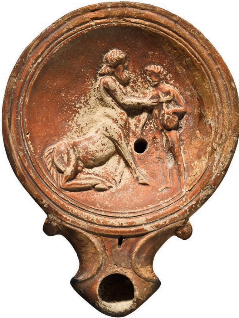
FIGURE 3 Oil lamp with Chiron the centaur and Achilles. Copenhagen, Thorvaldsen Museum.

lamp preserved in the Thorvaldsen Museum, H1176 (Figure 3) and the gem in the Collection Walters (42.1161; see S.11), showing Chiron half man/half horse placing one arm on a young naked Achilles, who holds the lyre in one of his hands. The idea of the moral effects that music has on human character and its consequent power on education was deeply rooted in Greek and Roman antiquity (cf. Anderson 1966 and Mathiesen 1984, 264ff.). Music (including melodies and rhythms) could cause diverse effects on the human mood: a dichotomy was already presented in the Iliad , where Homer distinguished the effeminate