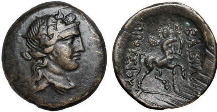
FIGURE 1 Coin issued by the King Prusias II of Bythina. 2nd century BC.