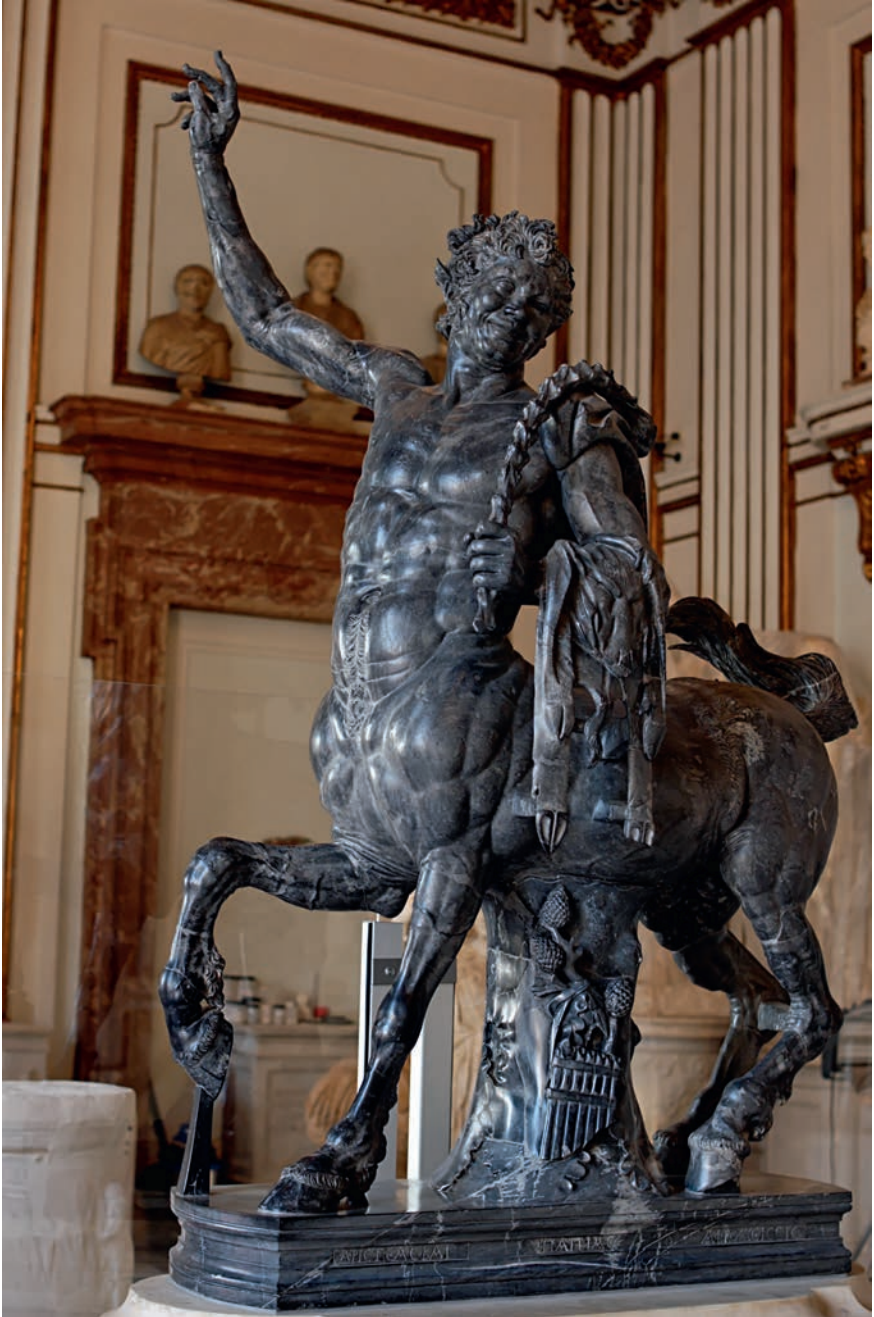
FIGURE 5 Young centaur by Aristeeas and Papias of Aphrodisias. Lucullan marble, Roman copy after Hellenistic original. Roma, Musei Capitolini.