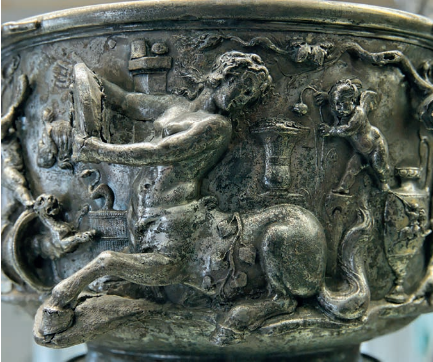
FIGURE 9 Detail of a silver cup, part of the Berthouville treasure. Paris, Bibliothèque Nationale, Cabinet of Médailles, c. 50 AD.