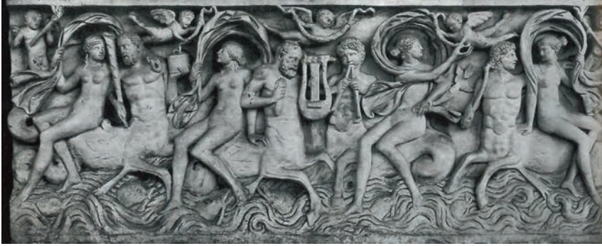
FIGURE 10 Marine centaurs playing instruments, Sarcophagus. Roma, Museo Nazionale Romano, 2nd century AD.