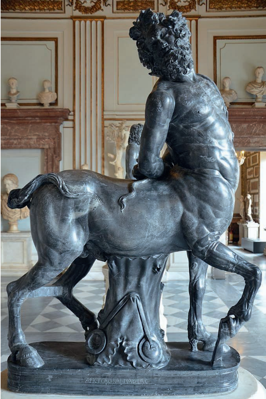
FIGURE 4 Old centaur by Aristeas and Papias of Aphrodisias. Gray-black marble, Roman copy (117-138 AD) after Hellenistic original. Roma, Musei Capitolini.