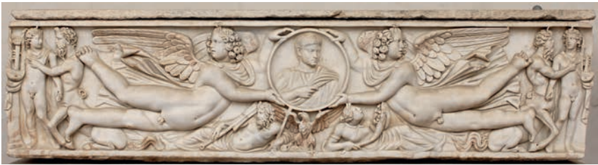
FIGURE 11 Roman sarcophagus, Achilles and Chiron. White marble. Roma, Museo Nazionale delle Terme. 2nd to 3rd century AD.