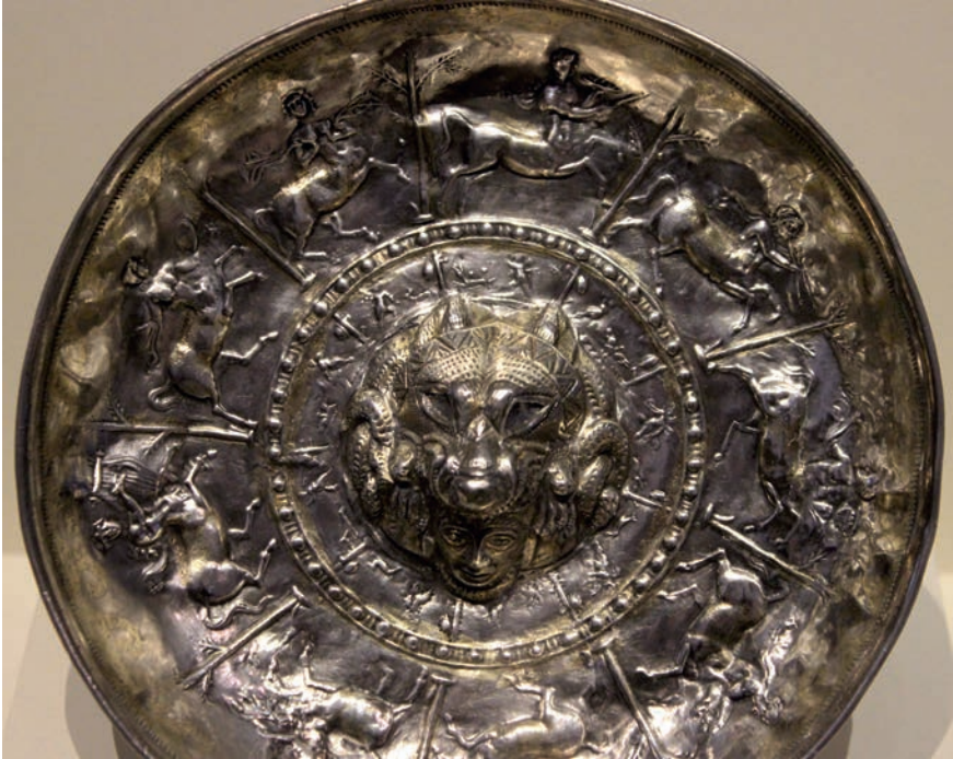
FIGURE 6 Patera from Santiesteban del Puerto. Madrid, Museo Arqueológico Nacional. 250-76 BC (estimated chronology).