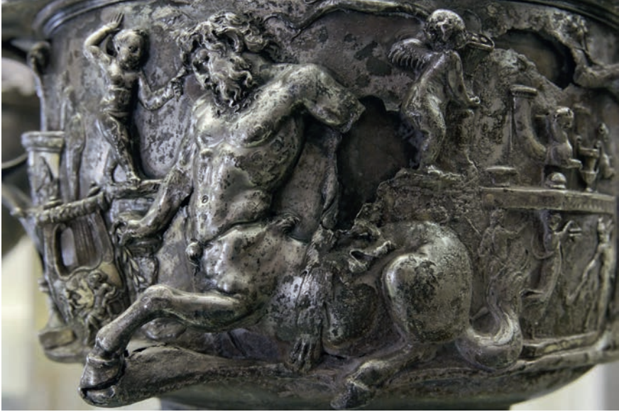
FIGURE 8 Detail of a silver cup, part of the Berthouville treasure. Paris, Bibliothèque Nationale, Cabinet of Médailles, c. 50 AD.