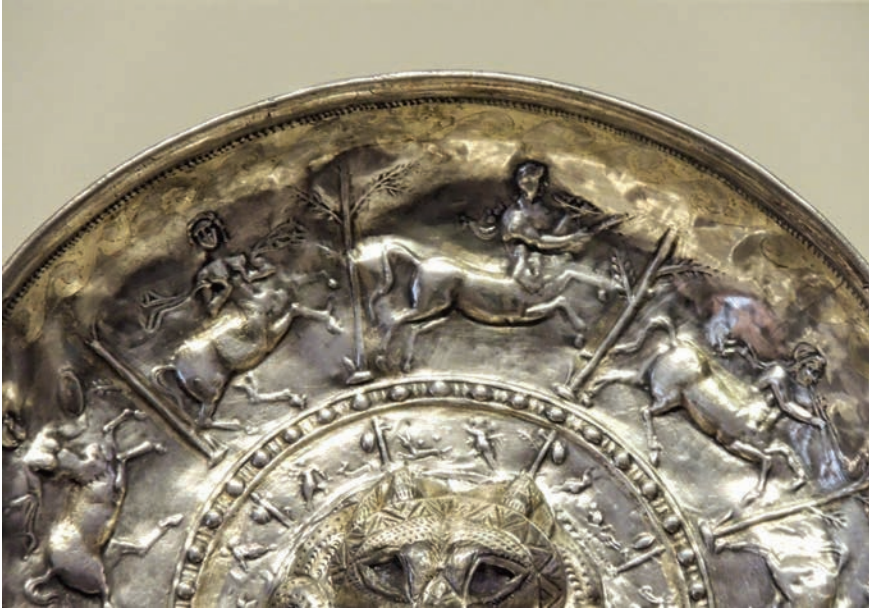
FIGURE 7 Patena from Santiesteban del Puerto. Madrid, Museo Arqueológico Nacional. 250-76 BC (estimated chronology).

drama are the centaurs. The contrasting demeanor of each couple demonstrates the frenzied freedom and painful enslavement induced by the god's peculiar nature" (Griff 1984, 385).