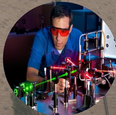
Soft, Condensed & Biological Matter Physics

Our department is recruiting motivated students from around the world to join our PhD program in physics starting August 2020.