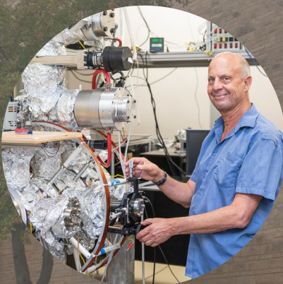
Atomic, Molecular & Optical Physics