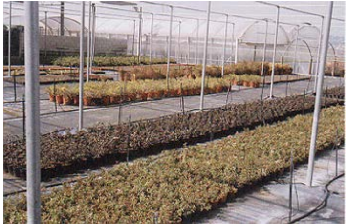
Application of technology in the nursery sector, for decontamination and reuse of drainage water.

The economic benefits are obvious, to which we must add the environmental advantages, as eliminating waste does not generate other pollutants.