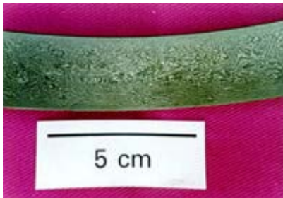
"Waters" characteristic of Damascus steel

The advantages of Damascus steels compared to other carbon steels or alloys is their high wear resistance which allows them to have a cutting edge permanently, together with good mechanical strength and toughness. To these unique mechanical characteristics, in applications of cutting or machining of other metals, the beauty and the magic of its surface is united, something that has made them legendary in the celebrated swords of Damascus.