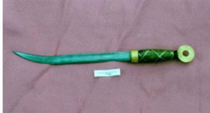
Forging process of Damascus steel and example of finished knife.