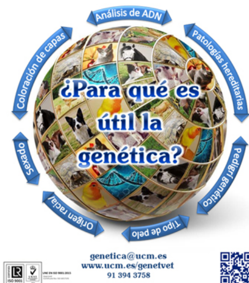
Image of Genetic Service.

Servicio de Genética Facultad de Veterinaria Universidad Complutense de Madrid