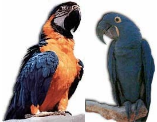
Couple of Macaws.

Another advantage is the possibility of sexing not only from blood but from other samples as feathers or membrane collected in the shell of a recently hatched egg, the last one allows an early sexing.