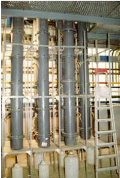
Bioleaching columns: treatment of uranium ores at semi-pilot scale.

The fundamentals of the different fields within biohydrometallurgy can be summarized as follows: