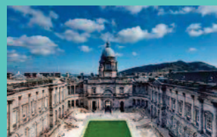
THE UNITED KINGDOM (SCOTLAND) The University of Edinburgh