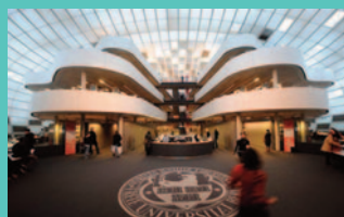
GERMANY Freie Universität Berlin