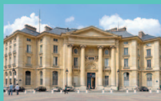
FRANCE Université Paris 1 Panthéon-Sorbonne