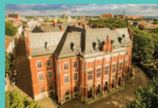
POLAND Uniwersytet Jagielloński w Krakowie