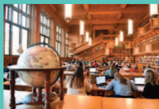
BELGIUM KU Leuven