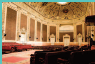
SPAIN Universidad Complutense de Madrid