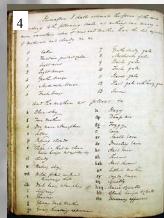
Francis Beaufort's first wind and weather scale (1806)

To obtain a copy of the data (CD-ROM or via ftp) please go to www.ucm.es/info/cliwoc for details.