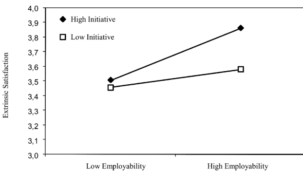
Figure 1. Effects of the Interaction of Employability and Initiative on Satisfaction with Extrinsic Aspects.

The aim of the present work was to determine the direct predictor role of employability and personal initiative and their interaction, in extrinsic, intrinsic and social dimensions of job satisfaction. Authors such as Forrier and Sels (2003) and Hillage and Pollard (1998) suggest that employable people obtain work which they find satisfactory. This might be caused by the fact that employability is highly valuable in the labour market and therefore enables one to chose and negotiate conditions at work. On the other hand, the market value of employable people might be determined by their high human capital; that is to say, knowledge, skills