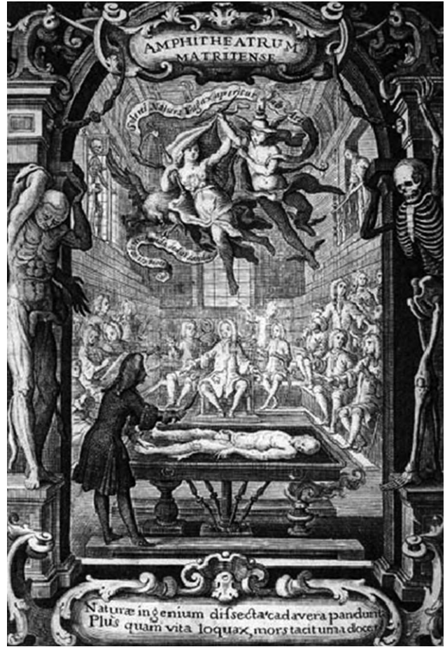
Fig. 3. Portrait of anatomical amphitheater of San Carlos' Royal College of Surgery of Madrid.