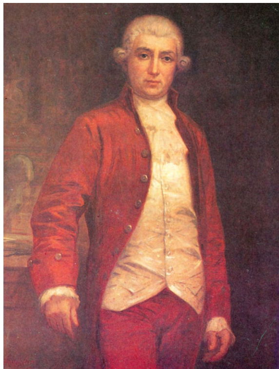
Fig. 1. Portrait of de Antonio Gimbernat y Arbós. [Color figure can be viewed in the online issue, which is available at wileyonlinelibrary.com .]