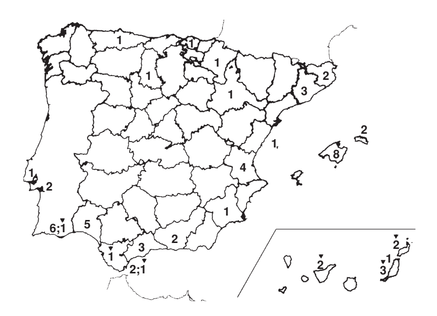
FIG. 1.—Records of yellow-browed warblers Phylloscopus inornatus in the Iberian Peninsula and the Balearic and Canary Islands. Figures marked with ▼ relate to winter or spring records (January to April). [Registros de mosquitero bilistado Phylloscopus inornatus en la península Ibérica y las islas Baleares y Canarias. Las cifras señaladas con ▼ se refieren a registros de invierno o primavera (de enero a abril).]

In the Peninsula, most records come from the eastern and southern coasts, with very few in the hinterland, only two on the Biscayan coasts and none in the northwest (Galicia and northern Portugal). The first published occurrence was at Gibraltar in 1932 but this record is now discounted (Cortés at al., 1980). The next two recorded occurrences were both in 1967 (Valverde, 1968). Afterwards the distribution of records by five-year periods is as follows: 3 in 1980-84, 11 in 1985-89, 6 in 1990-94, 14 in 1995-99 and 22 in 2000-04. Although half of the Pallas's warbler records were in spring only three of the yellow-browed warblers were in March (all of them in the Canaries: on 6<sup>th</sup> March 1987, 27th March 1991 and 18th January-10<sup>th</sup> March 1997) and only one in April (Albufeira, southern Portugal, 1<sup>st</sup> April 2001). Up to 45 records (73.8%) fall in October-November but 13 were between December and February: five in Iberia, seven in the Canaries