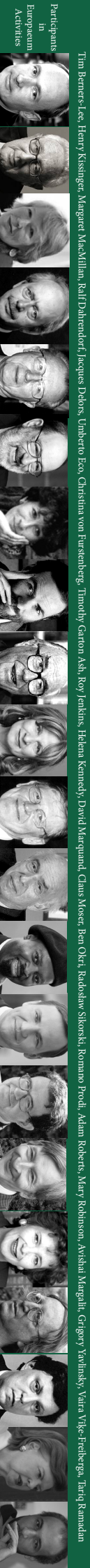
Participants in Europaëum Activities